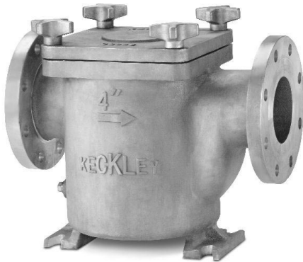
Sizes 1½" to 8"