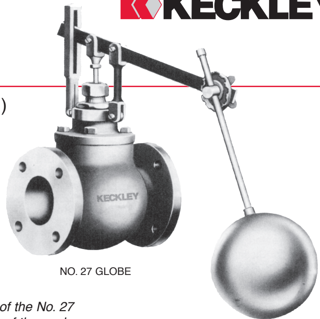
NO. 27 GLOBE

BRONZE • CAST IRON • STAINLESS STEEL BODY