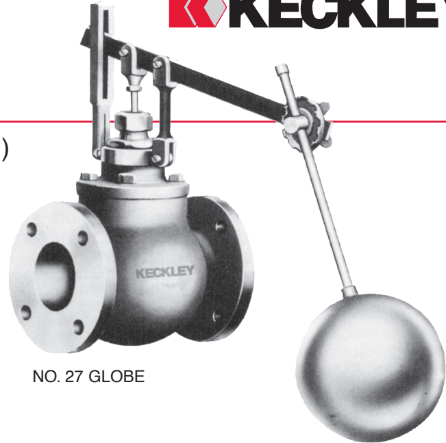
NO. 27 GLOBE

BRONZE • CAST IRON • STAINLESS STEEL BODY